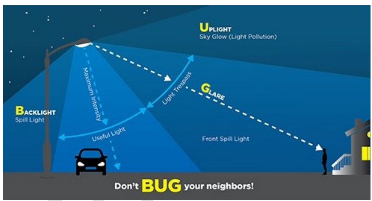
Figure IV-1:

a. All outdoor Lighting Fixtures shall have a maximum BUG Rating of zero (U0) to prevent Glare, Light Trespass, and sky glow. Fixtures that do not have a BUG Rating shall be classified by the IES as Fully-Shielded Fixtures or shall have the "DarkSky Approved" seal of approval.