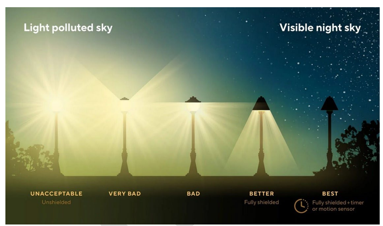
Figure IV-2.