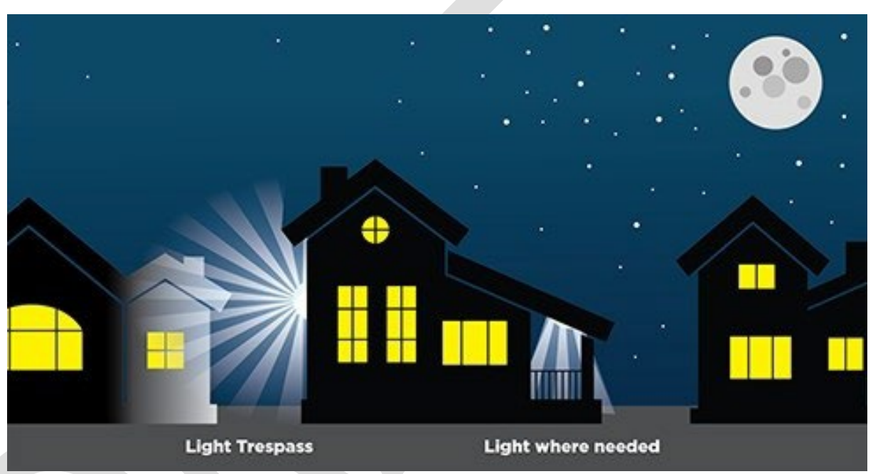
Figure IV-4.