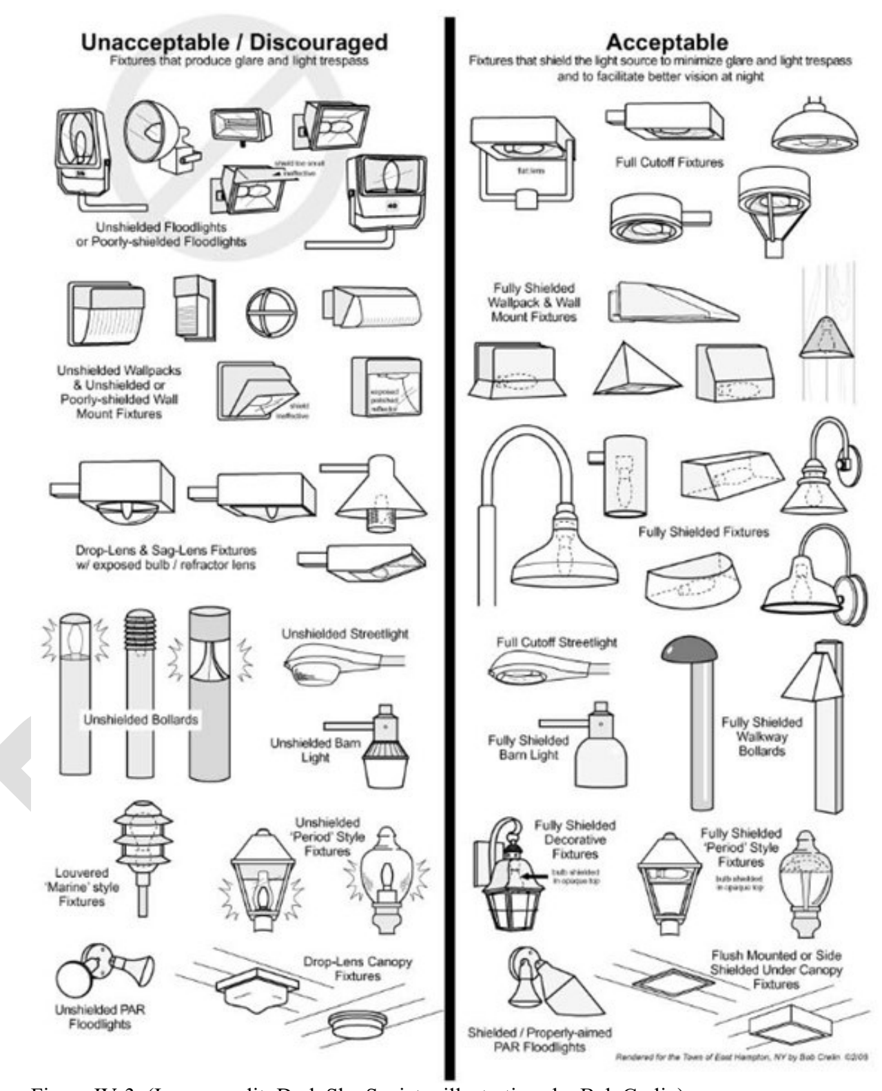
Figure IV-3. (Image credit: Dark Sky Society, illustrations by Bob Crelin)

3. Correlated Color Temperature (CCT) . All LED light sources shall have a maximum Correlated Color Temperature of 2,700K.